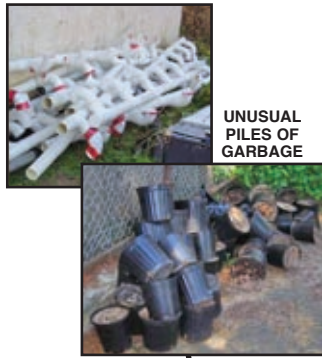
UNUSUAL PILES OF GARBAGE