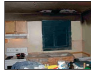
EVIDENCE OF FIRE DAMAGE