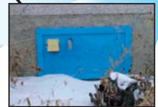
VENTS REPLACE WINDOWS