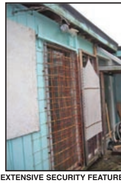
EXTENSIVE SECURITY FEATURES