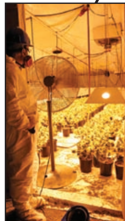
EXTRA LIGHTING AND FANS