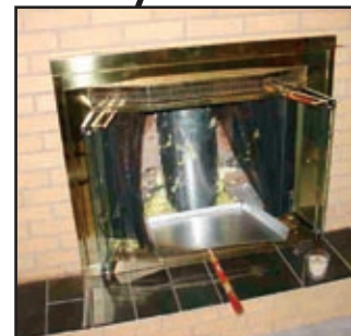
FIREPLACE CHIMNEY REROUTED

If you suspect a grow op do not approach or investigate yourself. Contact Police or Crime Stoppers