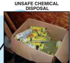
UNSAFE CHEMICAL DISPOSAL