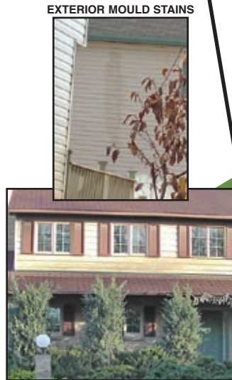
EXTERIOR MOULD STAINS